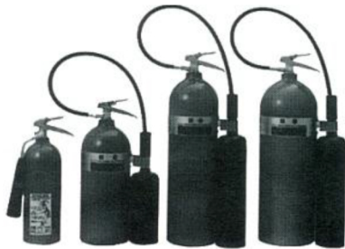
□ CD5 □ CD10 □ CD15 □ CD20