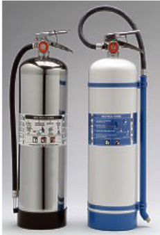
PW2½ & WM2½

This unit is designated for use wherever there is a Class A hazard near electrical equipment and the environment is of paramount concern. The extinguishing agent is de-ionized water, and the wand provides greatest operator safety. There is no risk of electrical conductivity or thermal or static shock. Ideal for use in health care, data processing, telecommunication, and clean room facilities. (Shipped empty)