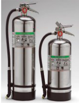
WC2½ & WC-6L