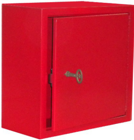
SVC-13 With Optional Color

New—Deeper SFC 11 & 12, SSFC 31 & 32 Cabinet Now Fits 10 lb Cosmic and Galaxy!!