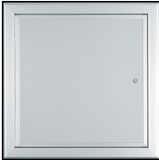
Lightweight Access Panels