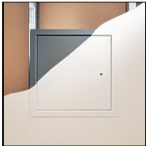
Fire-rated, flush access panel for all applications

Larsen's has a fire-rated access panel for any wall or ceiling application. The 1" wide flange frame ( L-FRAP ) is standard. Stainless steel units are available in 304 with #4 finish ( L-FRAPSS ). For concealment, Larsen's offers drywall corner bead or plaster bead frames. These will allow finish material to be applied, leaving only the panel exposed (please contact Larsen's for sizing and availability).