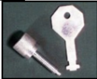
Standard knurled knob/key operated latch bolt