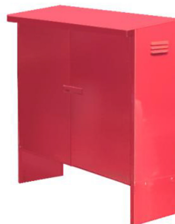
HECIGL OR HECIRL