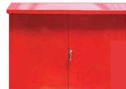
HECIG OR HECIR CABINET W OPTIONAL TOP & BOTTOM LATCHING SYSTEM WITH CHROME HANDLE