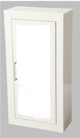
CS2013 with Optional S21 Solid Front