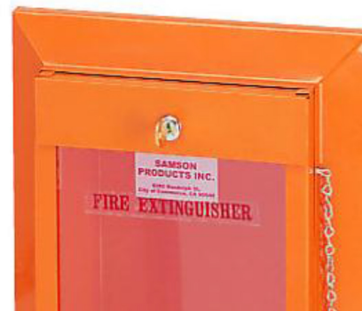
1½" Wide Trim Flange on Recessed Models Optional Orange Color Shown