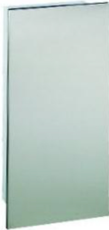
5634S21 Stainless Steel