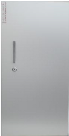
5634L22 Stainless Steel