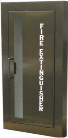
2046V10 US10B Oil-Rubbed Finish with Etched White Colorfilled Lettering

** Cosmic and Galaxy 20 must be hung on the back of the cabinet tub.