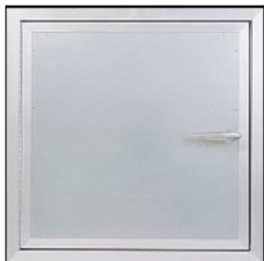
Exterior Access Panels