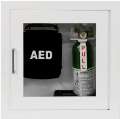
1915F12 Cabinet with 3/8” Flat Trim

Description: 1900 Series is designed to accommodate most AED’s on the market today with room for an oxygen tank. Recessed models are ADAC-Compliant . Select from steel, stainless steel or aluminum construction. Trim Construction: CRS with white powder-coat finish, #4 brushed stainless steel or clear anodized aluminum. 1-3/4” trim on face. Door: Formed door with 1-3/4” trim, mounted in a 5/8” door stop with zinc-plated handle and roller catch and continuous hinge. All models feature a clear acrylic window with graphics enclosed, zinc-plated handle and roller catch. Trim Style & Depth: Recessed – 3/8” flat trim, Semi-Recessed – 1-1/2” square edge or 3” rolled edge. Surface-mount has a square edge. Alarm: 85 db Commander (audible) alarm standard. Tub: White powder-coated CRS. Fire-rated available - See Separate Submittal Oxygen: Accommodates up to “D” size cylinder. See options below. Fire-Rated Option: Yes - See separate submittal.