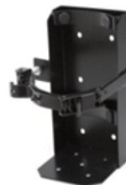
MB809C MB809A MB810C MB810A MB811C MB812A (all black)