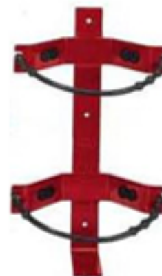
MB864A (all red)