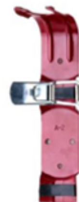
MB818C (chrome strap) MB818A (all red)