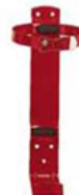
MB808A (all red)