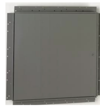
PW with 3/4" Plasterguard