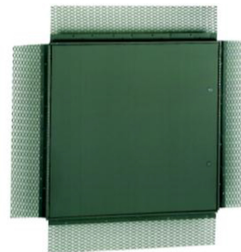
PWE With 3" Expanded Metal

Lock: Flush screwdriver-operated steel cam standard.